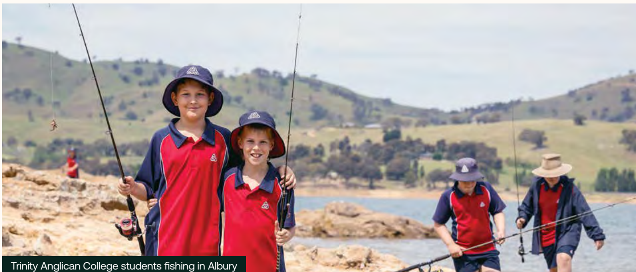
Trinity Anglican College students fishing in Albury

New South Wales is home to world-class universities, research organisations, and vocational education and training institutions.