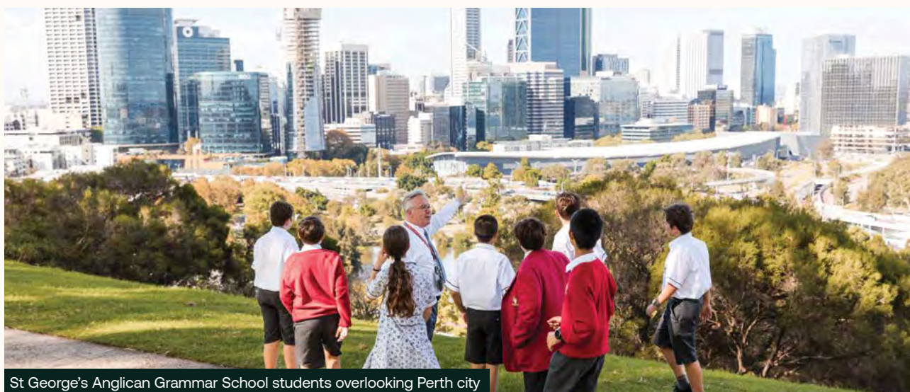
St George's Anglican Grammar School students overlooking Perth city

Perth is the capital city of Western Australia. One of the fastest growing cities in Australia, Perth offers diverse opportunities for study and employment.