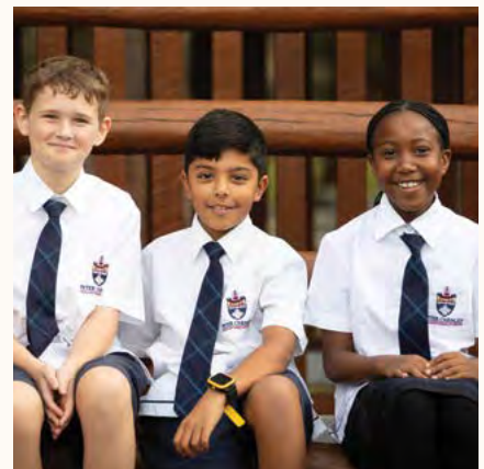
Images above: A selection of students and teachers from AngliSchools across Australia